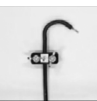
Large Capacity 2.8mm Forceps